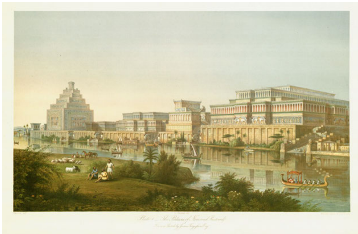
James Fergusson. The Palaces of Nimrud Restored . From Austen Henry Layard. A Second Series of the Monuments of Nineveh . London: Murray, 1853

In 879 BCE (almost 3,000 years ago!) Ashurnasirpal II, a king of the Assyrian Empire, had over 200 reliefs made, including the ones at Bowdoin, to hang on the walls of his new royal palace. They were designed to highlight the king's power, tell the stories of his battles, and remind visitors of the greatness of the empire. Today, these reliefs are housed in museums and institutions all over the world.