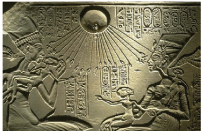
Sunken relief of Akhenaten, Nefertiti and their Daughters, ca. 1440 BCE