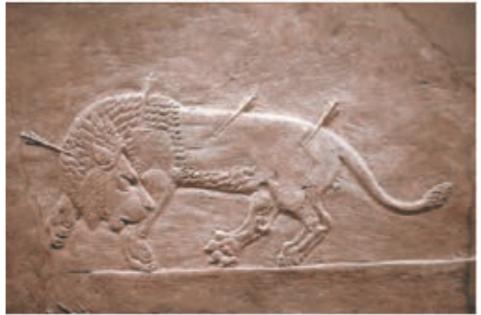
Assyrian Dying Lion in Low Relief.