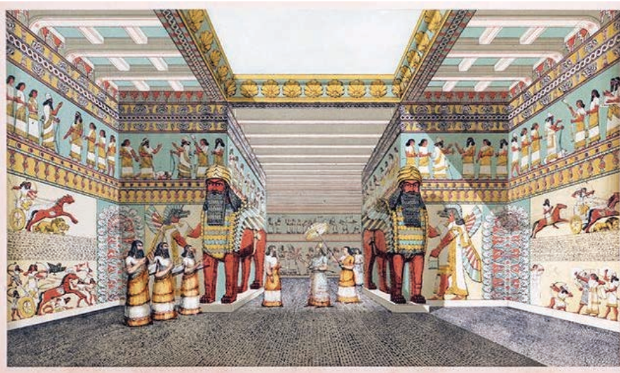
Austen Henry Layard. ca. 1849. Northwest Palace

Why do you think there is so little color remaining on the surfaces?