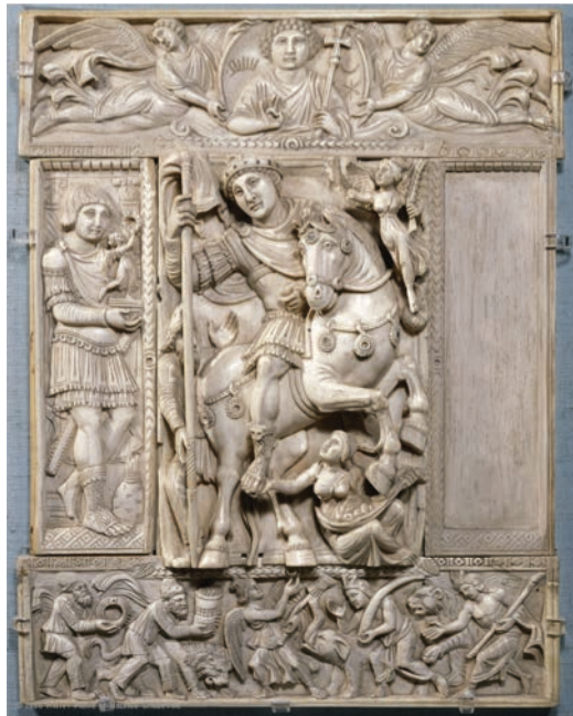
Diptych panel in five parts: the Emperor Triumphant (Justinian?), first half of the 6th century, ivory, traces of inlay, The Louvre Museum