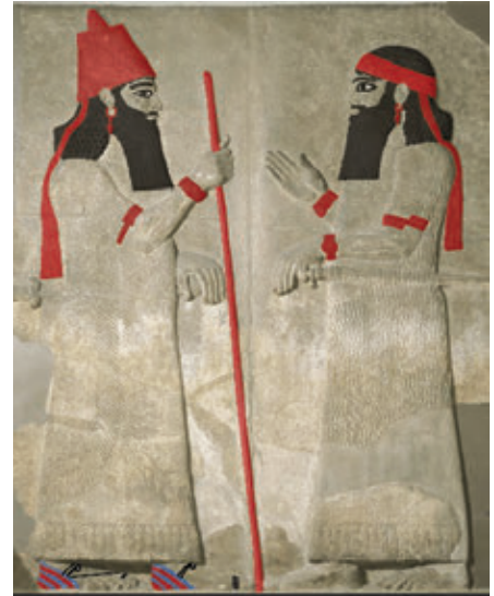
Digital re-colorations of a relief from the exterior of the palace of Sargon II at Khorsabad, (© Li Sou & the Trustees of the British Museum).

The image on the left is one rendition of how the inside of the palace might have appeared during the reign of King Ashurnasirpal II. This model also includes painted murals that were in the palace which may have included more colors than the reliefs. To the right is another interpretation of color on the reliefs. The truth is, we don't know exactly what the original reliefs looked like; it's something scientists and historians still debate today.