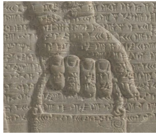
Assyrian Relief: Winged Spirit of Apkallu from Kalhu (Nimrud), Iraq, ca. 875–860. Bowdoin College Museum of Art.

Scholars have translated much of what is written on the reliefs. The script describes the history of the Assyrian Empire and the city of Kalhu, and goes into great detail about the mighty power of King Ashurnasirpal II. Below is a cuneiform text originally carved into a relief similar to those at Bowdoin. This is an excerpt from a line that describes the king as the “wonderful shepherd, fearless in battle.” Try to copy the cuneiform figures in the box below!