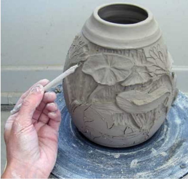
Floral Carved Pot